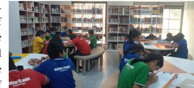
Budding script writers!!