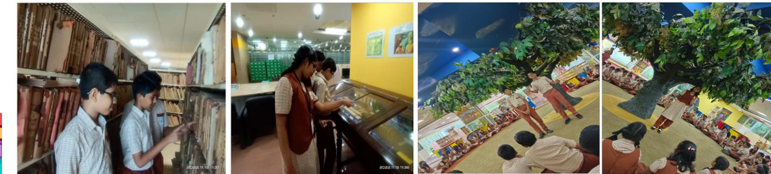
Enthralled by the preserved manuscripts of the Tamil literature.