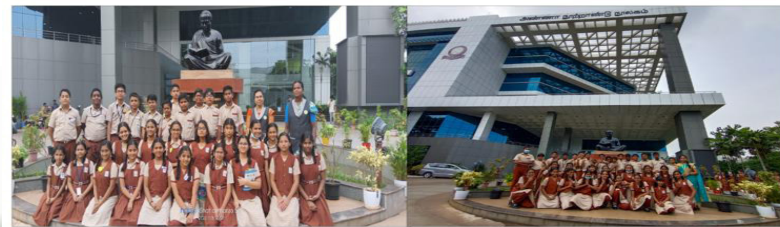
Visit to 'The Anna Centenary Library'.

The children's section also fascinated them. They had an opportunity to share their wisdom with their fellow school mates in the common arena in the Library.