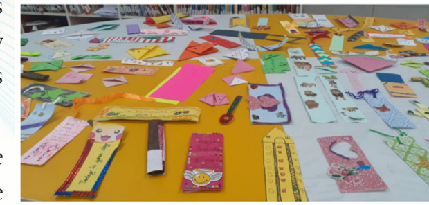
Creating book marks that inspire!!

To crown all the events, students from the middle school were given an opportunity to visit one of the huge custodian of books, the 'Anna Centenary library' a state-of-the-art library which hosts five lakh books. Students were enthralled by the giant magnitude of the multistoreyed gateway of wisdom. Students were guided around the library to various sections. The Tamil literature section was the centre of attraction for the children as there were numerous great literary works of the Sangam were preserved as manuscripts.